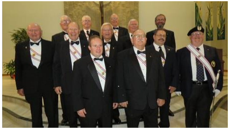
The 4 th degree was asked to serve as honor guard for the 50 th Anniversary Celebration of Catholic Daughters of America Court #2007